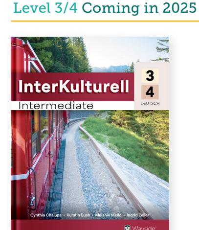
Intermediate Low to Intermediate High