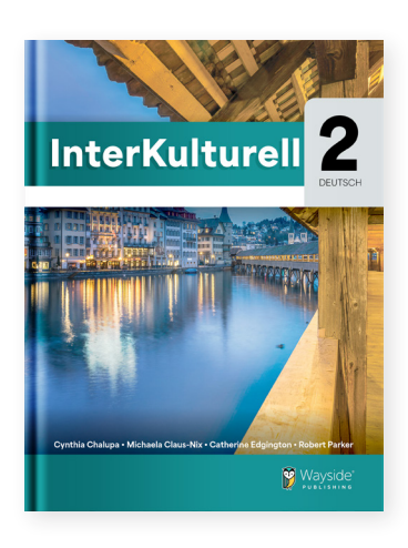
Novice High to Intermediate Low