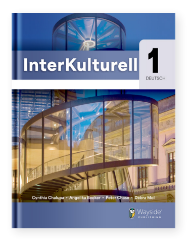
Novice Low to Novice High