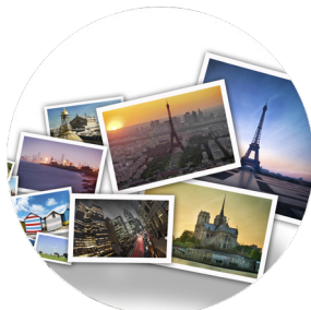
Use Images to Build Meaning