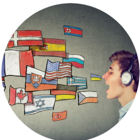
Maximizing the Use of Target Language