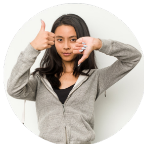
Thumbs Up/ Thumbs Down