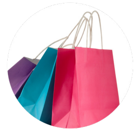
What's in the Bag?