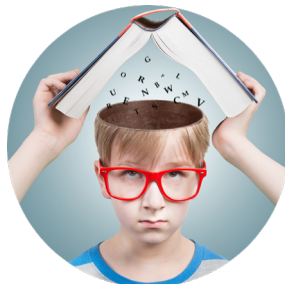
Repetition of Key Vocabulary/ Concepts